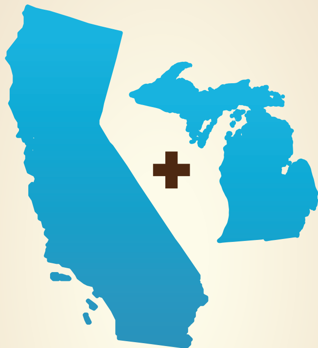
California's Population + Michigan's Population

Over the next 20 years, California's population will grow by 10.2 million people — an increase that is equivalent to adding the entire state of Michigan.